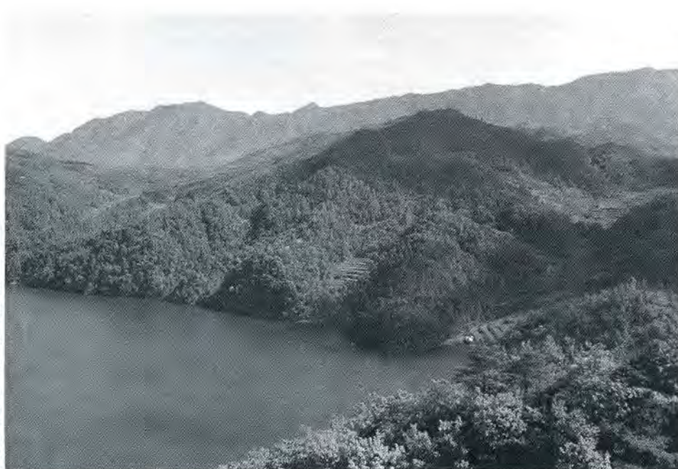
A panoramic view of Chung Pyung Lake, Korea.