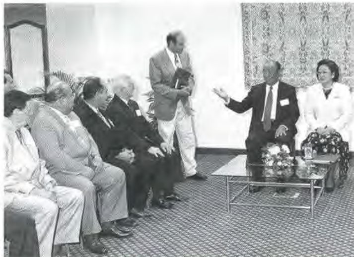
True Parents meet with the head table participants prior to the farewell banquet.