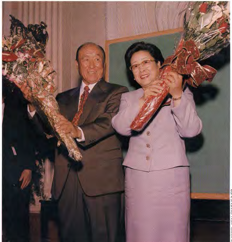
True Parents receive a bouquet of flowers on stage on True Parents' Day.

What is the meaning of True Parents? Because Adam and Eve failed to establish the ideal family, the entire world has become satanic. Now, with the advent of the True Parents on this earth, you all have to follow the perfected Adam's family. No one can enter the Kingdom of God without True Parents' grace. You have to follow our footsteps. By doing so you will