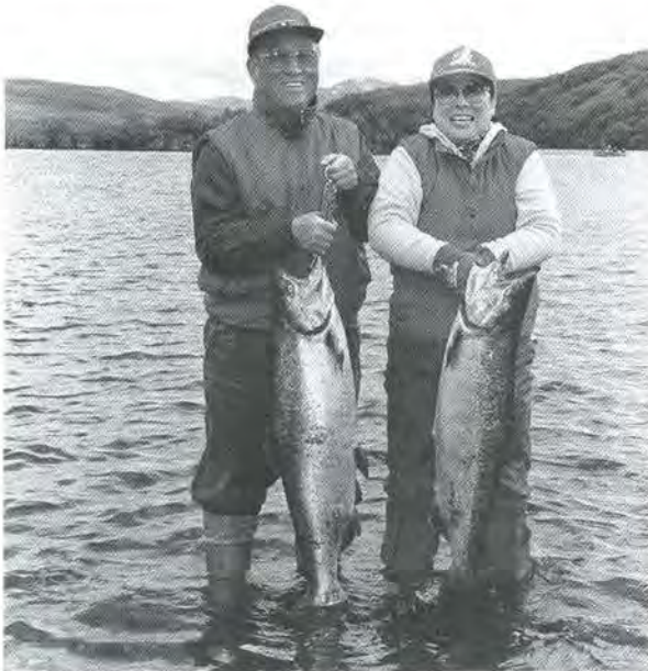
Front Cover: Father and Mother rejoice and pose for a picture after catching king salmon in Karluk, Alaska, on July 15, 1996.