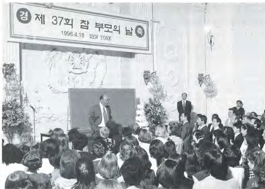
Father speaks to members of the New York area on True Parents' Day.

death when the silk is produced. The silk is the substance which forms its cocoon. When the time of maturity arrives it makes a hole in its cocoon and emerges as a butterfly. Unification Church members are now like silk worms who are fully grown and mature, and we should have enough silk inside our wombs to produce our cocoon. The silk produced by silk worms is so good that nothing can penetrate it except the butterfly's own teeth chewing it from the inside. This is a special power that we have. Do you understand? [Yes.]